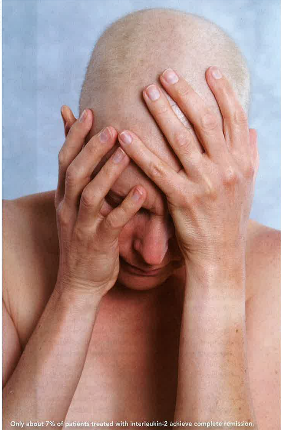
Only about 7% of patients treated with interleukin-2 achieve complete remission.

We have now serially monitored patient's blood samples to determine the immune cycle and then used accurate personalised treatment approaches to create successful clinical responses, even after the failure of other therapies. These examples indicate that the techniques we propose are both achievable and effective, but require improvement, testing and wider acceptance.